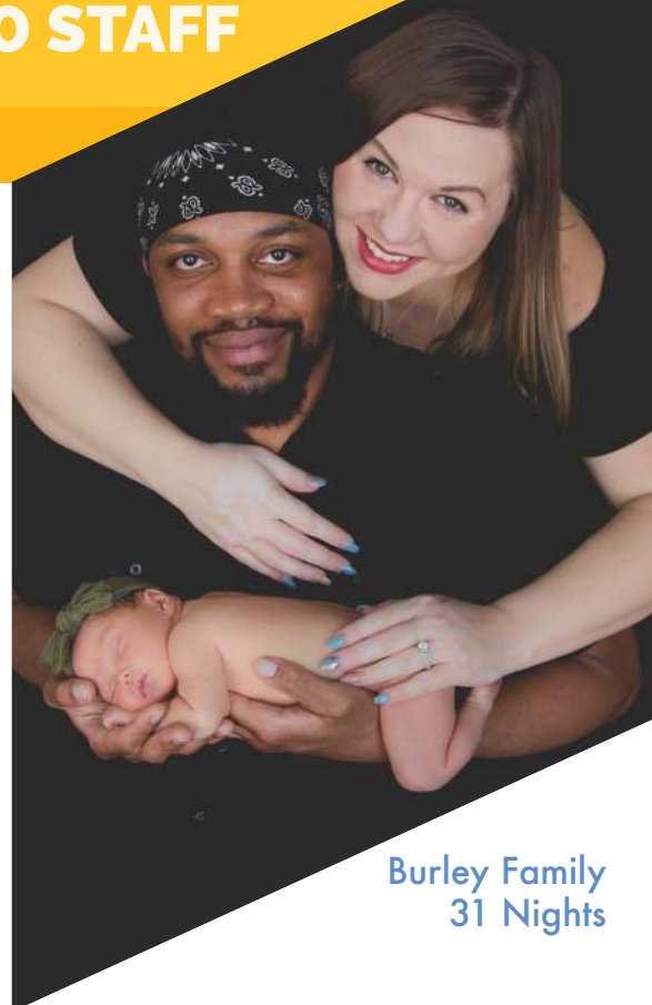
Burley Family 31 Nights

A special thanks to our interns and security team who committed their time and talents to RMHC in 2020.