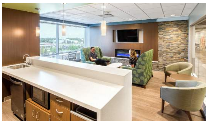
Ronald McDonald Family Room at Essentia Health