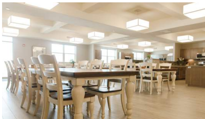
Open-concept dining room that connects to multiple kitchen areas.