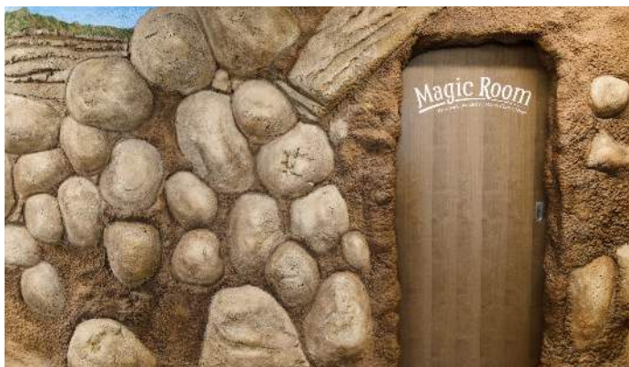
The Magic Room