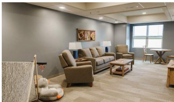
Upstairs family room equipped with couches and a TV.

The Ronald McDonald Family Room serves as a respite for families with babies receiving medical care at Essentia Health Hospital in Fargo. Like the Ronald McDonald House, the Ronald McDonald Family Room at Essentia Health is designed to support families through their child's medical journey—whether it's a break from the clinical environment, a restorative nap or night's rest, or a sense of normalcy. We provide a relaxed space for families to grab a snack or a drink, take a shower, or take a quick break just steps from their critically-ill child, if only for a few moments.